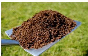
For acid-loving plants, use Black Gold Garden Compost

I love a good rich soil, so prepare a planting mix of 1 part Black Gold Garden Soil, 1 part native soil, and for an extra boost, add