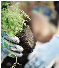
Remove the plant and loosen the roots gently.

Carefully remove my container by holding the top of my rootball and gently sliding me out. If needed, loosen my roots slightly with some gentle squeezing. Be careful not to disturb my roots too much or I'll go into shock.