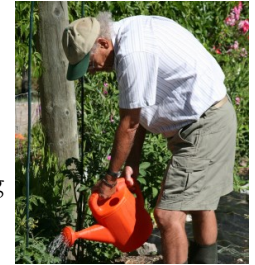
Watering new plants is critical, even a single day missed can weaken them.

As a new plant, I'm going to need plenty of water to get growing. Follow this schedule to help me develop a strong root system: