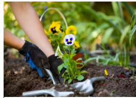
Build a dirt ring around larger plants and trees to hold water over the rootball.

Fill the hole with the planting mix from Step 2, packing the soil lightly to remove any air pockets. Soak thoroughly to make me feel at home in your garden.