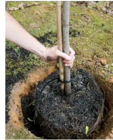
Make sure to plant level with the existing soil. The biggest planting problem we see is planting too deep.

Dig my hole twice as wide and the same depth as the container that I came in. Set me in the hole and be sure that the top of my rootball is level with the surrounding soil.